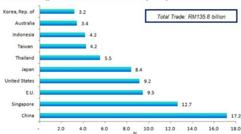
Figure 1: Percentage share of Total Trade by Major Countries, January 2017